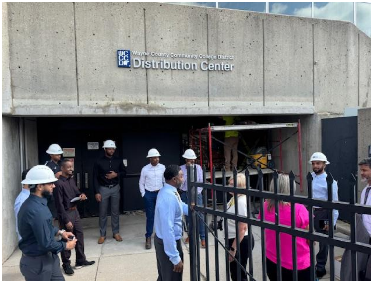
► Facilities Concrete Restoration Project