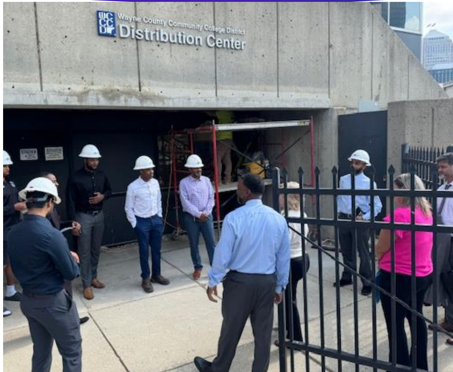
► Facilities Concrete Restoration Project