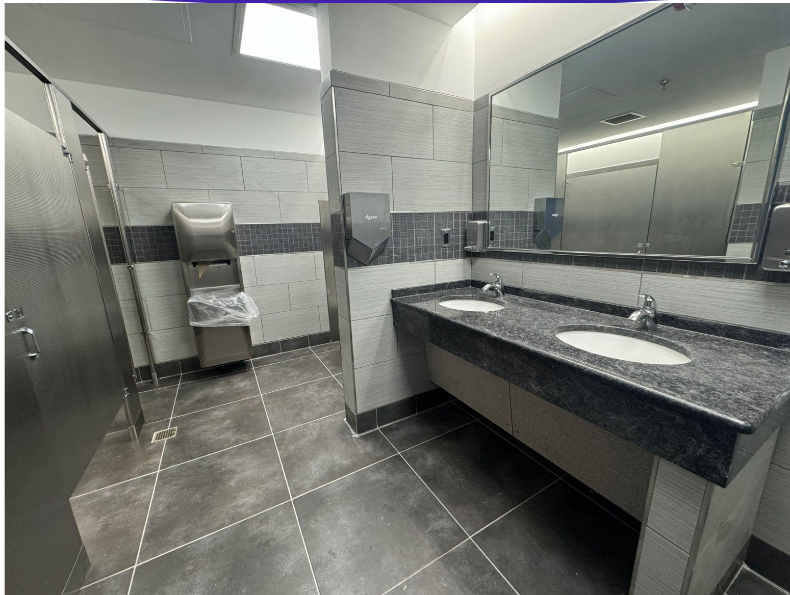
► Restrooms Renovation Project