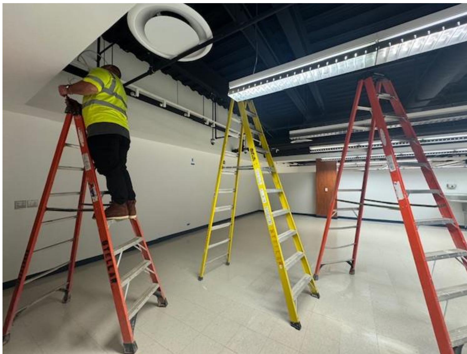
► Nursing Lab Renovation Project