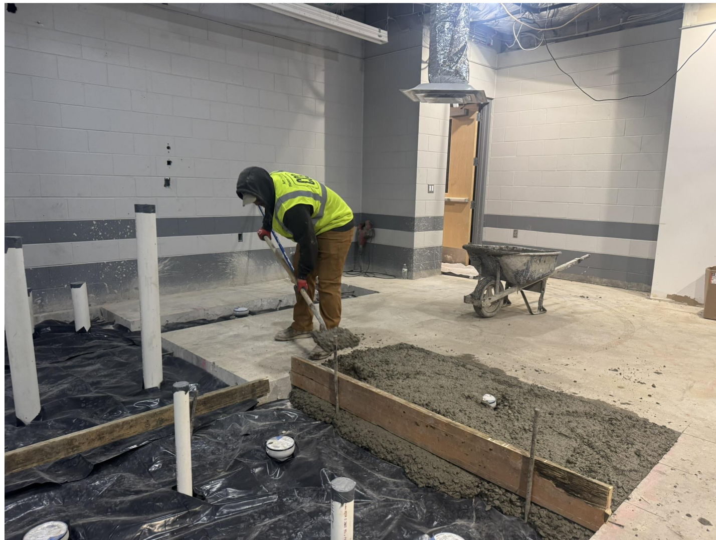
► Locker Room Renovation Project