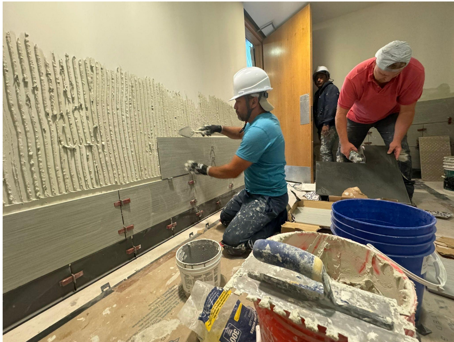
► Restrooms Renovation Project