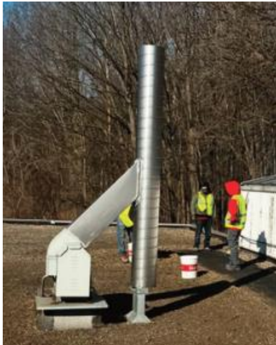
► Roof Repair Project