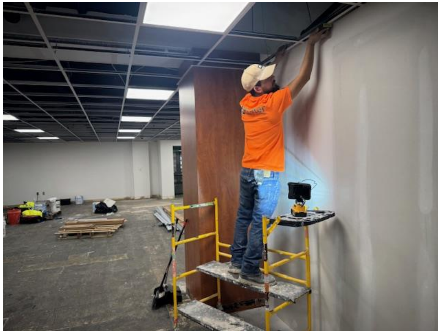
► Nursing Lab Renovation Project