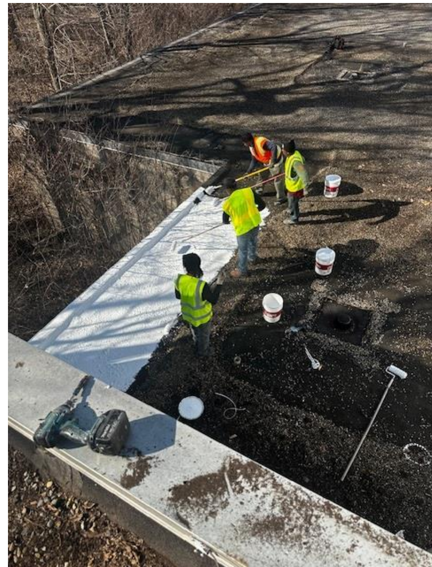
► Roof Repair Project