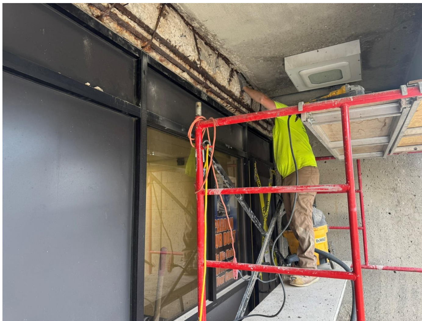
► Concrete Repair Project