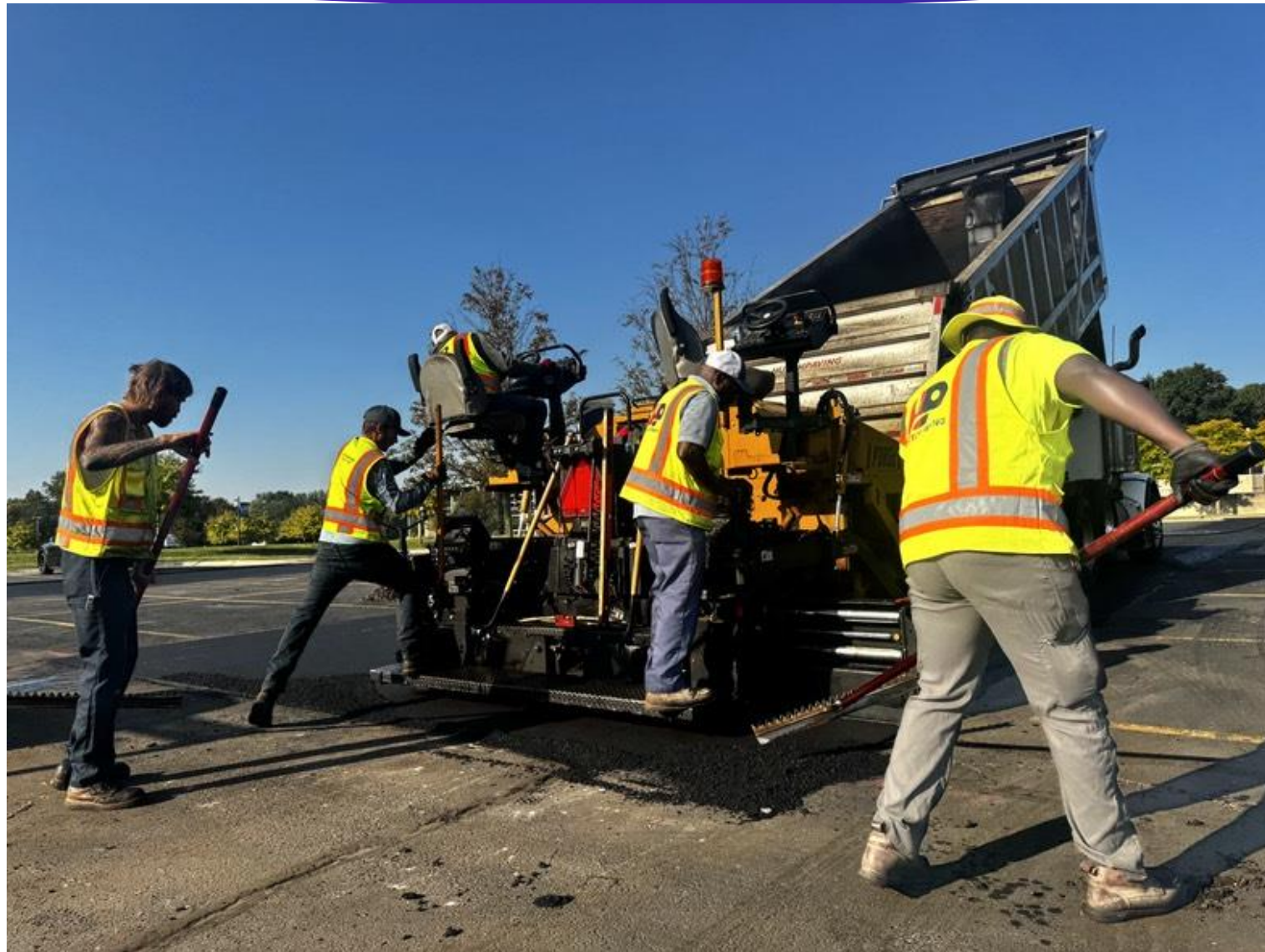
► Pavement Maintenance Program Project