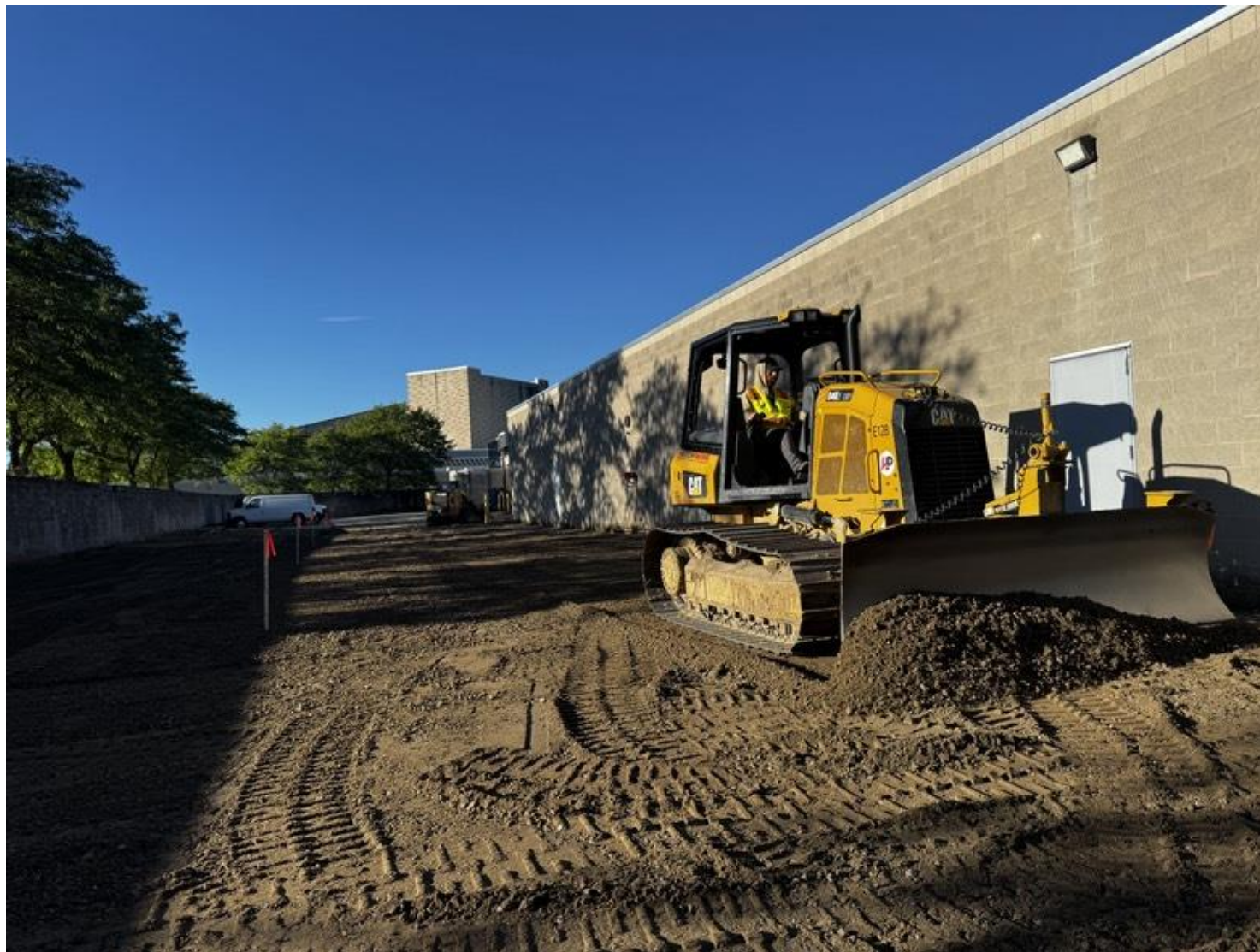
Paving Maintenance Program Project