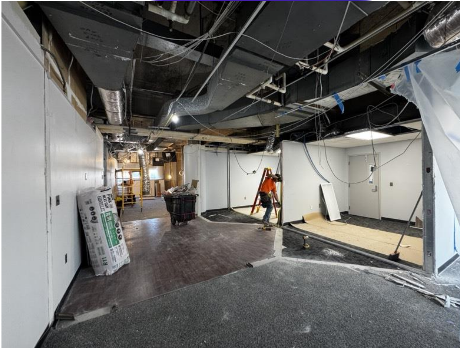
► 5 th Floor Improvements Project