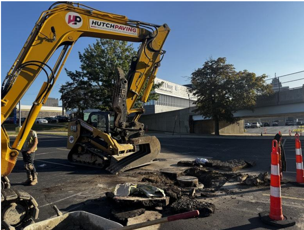
► Curtis L. Ivery Downtown Campus