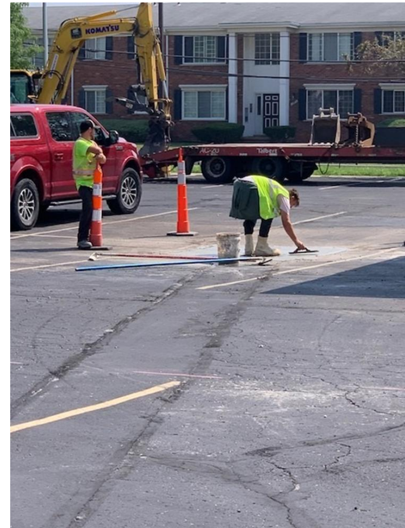
► Mary Ellen Stempfle University Center