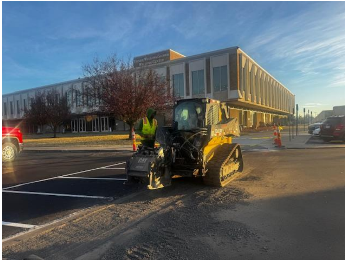
► Northwest Campus