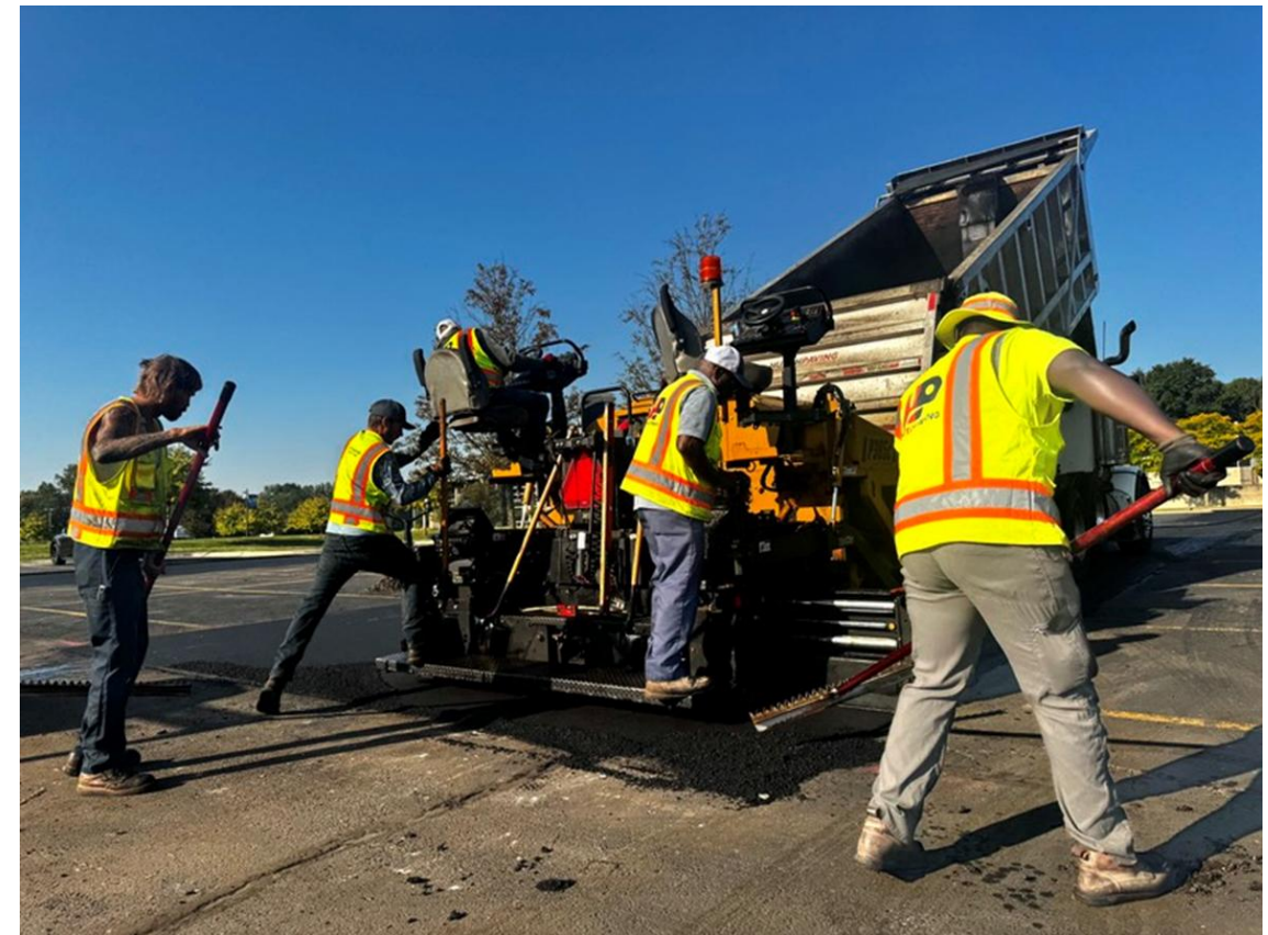
► Ted Scott Campus