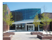
Ted Scott Campus