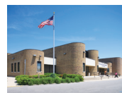
Mary Ellen Stempfle University Center