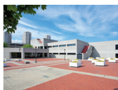
Curtis L. Ivery Downtown Campus