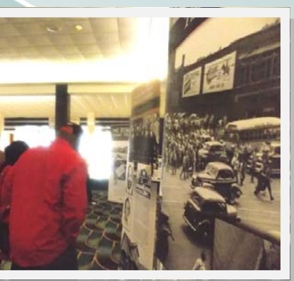
Ossian Sweet Trial Display

E. Martinus Whitfield presented a workshop titled "Career Day: Investing in Yourself." Topics of discussion included strengths and weaknesses for your selected career, adding value, positive attitude, professional networking, resume writing, and digital etiquette.