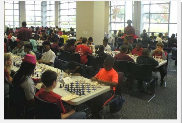
Detroit City Chess Club

The Northwest Campus hosted the Detroit City Chess Club Tournament for youths in grades K-12. Participants were taught how to sharpen and increase their chess skills through competition.