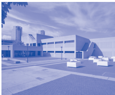
CURTIS L. IVERY DOWNTOWN CAMPUS 1001 W. Fort St. Detroit, MI 48226 313-496-2758