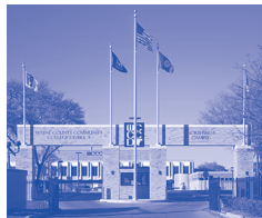
NORTHWEST CAMPUS 8200 W. Outer Drive Detroit, MI 48219 313-943-4000