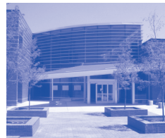
TED SCOTT CAMPUS 9555 Haggerty Rd. Belleville, MI 48111 734-699-7008