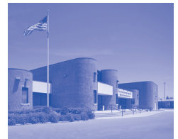
MARY ELLEN STEMPFLE UNIVERSITY CENTER 19305 Vernier Rd. Harper Woods, MI 48225 313-962-7150