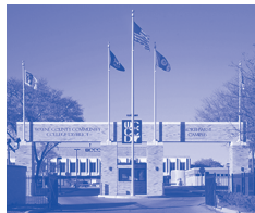
NORTHWEST CAMPUS 8200 W. Outer Drive Detroit, MI 48219 313-943-4000